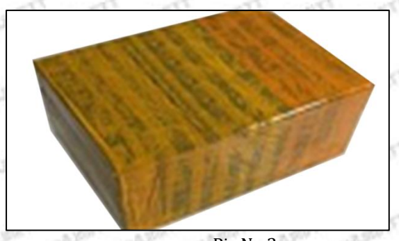
Pic No.3 International express packaging: Wrapped with yellow tape after wrapping black protective film

Mob/Whatsapp: +86 13410541523 Tel: +8675523215133 Email: ruby@shumatt.com